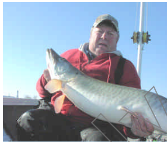
Caught November 26th

ple from my fishing group are continually catching fish in the upper 40's and lower 50's. My last day out by myself the day before Thanksgiving (November 26th) I caught this trophy measuring 48-1/4 in length and a girth