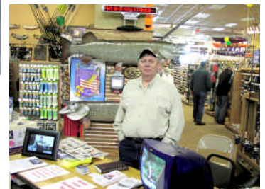
Last Year's Booth

So if you are looking for something to do that weekend come up to Cabela's and share a cup of coffee with me or visit my seminar. The Richfield Cabela's is located North of Milwaukee on Highway 43/41.