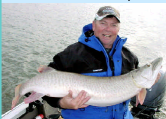
My 47 inch

After finishing my second season in Green Bay (Lake Michigan & Fox River) it has come without a doubt one of my best finds for trophy Musky Fishing. I have decided to add this special outing to my guided tours. It's unique prospect comes with special consideration. For many of my quests who live away from Eagle River, this comes as a good place to meet people half way or to shorten a ride by two to three hours.